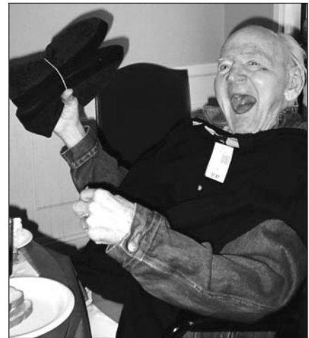
Thanks you so much for the sweatshirt and sweat pants. It sure put a big smile on my face!