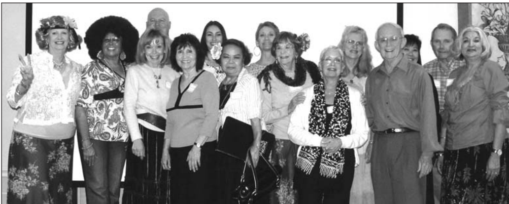
Friendly Visitor Volunteers