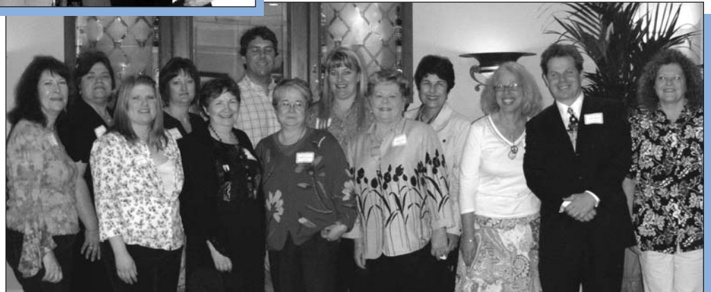
FAST (Financial Abuse Specialist Team) Volunteers