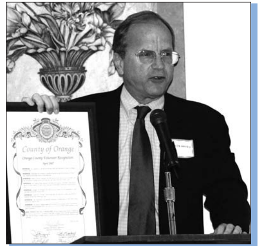
Orange County Supervisor Norby

Orange County Supervisor Norby presented a certificate recognizing the importance of our work for disabled and older adults at risk, while humorous stories from volunteers captured everyone's attention.