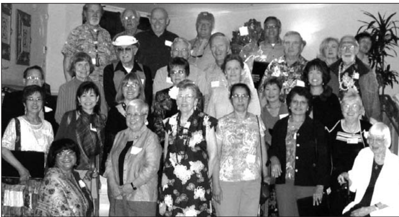
HICAP (Health Insurance Counseling and Advocacy Program) Volunteers